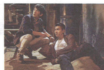
©2013 Prajna Works Entertainment Co., Ltd. All Rights Reserved.

特殊能力を備えたヒーロー4人の活躍を描くSFアクション。過去2回映画化されたが、本作はスタッフとキャストが一新された。4人(マイルズ・テラーら)の前に、とある脅威が迫ってきて…。ジョシュ・トラUNK監督。公開中。