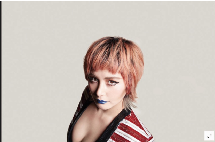
Dress $84,000 by Saint Laurent