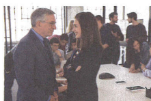
©2013 Prajna Works Entertainment Co., Ltd. All Rights Reserved.