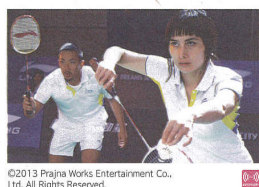
©2013 Prajna Works Entertainment Co., Ltd. All Rights Reserved.

ントンの能力もそうでした。みっちり練習しましたよ。私の役作りは完全に役を把握し、そもそも自分のものとするところから始まりますからね」。ホーが本作で見せる格好のいいフォームと猛烈なスマッシュは、役者魂の発露なのだ。