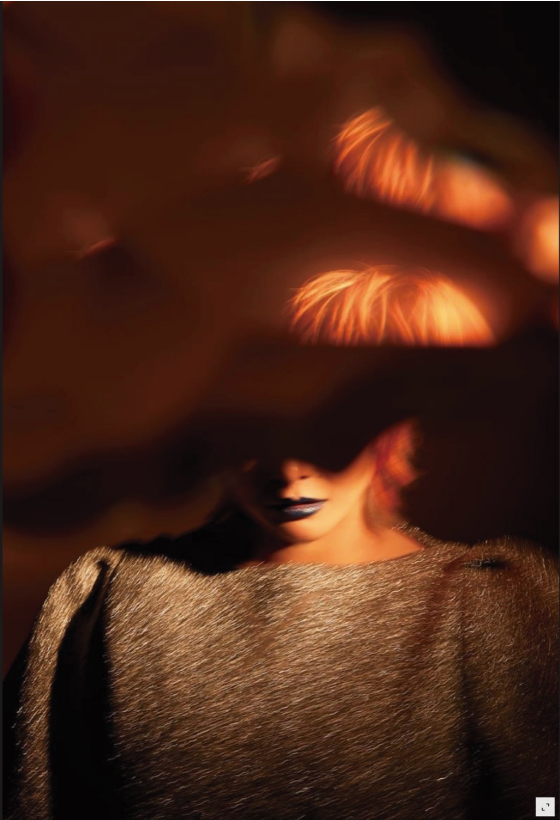
Dress $TBC by Marc Jacobs